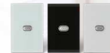
iZone Wireless Sensors