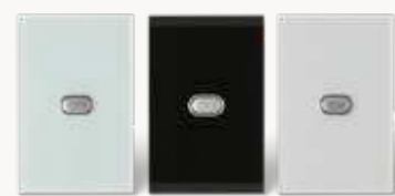
iZone Wireless Sensors

You can enjoy state-of-the-art wireless smart home precision and control, whether you're installing a new air-conditioning system or retrofitting an old one.