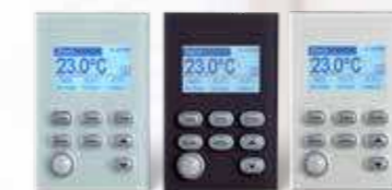
iZone iSense Controllers

iZone gives you total temperature control of each room or zone individually. iZone can operate up to 14 zones on any one system and every room or zone can be at the temperature you want, all the time.