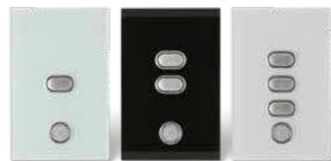
iZone Smart Switches

Ask your local Smart Alec about how you can get an iZone Smart Home Bundle for the same price as a standard ducted reverse-cycle system!