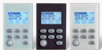
iZone iSense Controllers